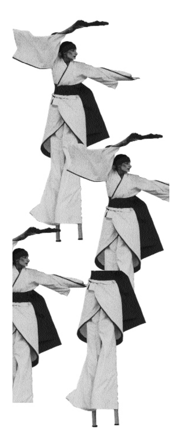
Bond Street Theatre in Roadworks .

intercultural stew; it is bound to offend. The predominant images today are not about being - they are about having .